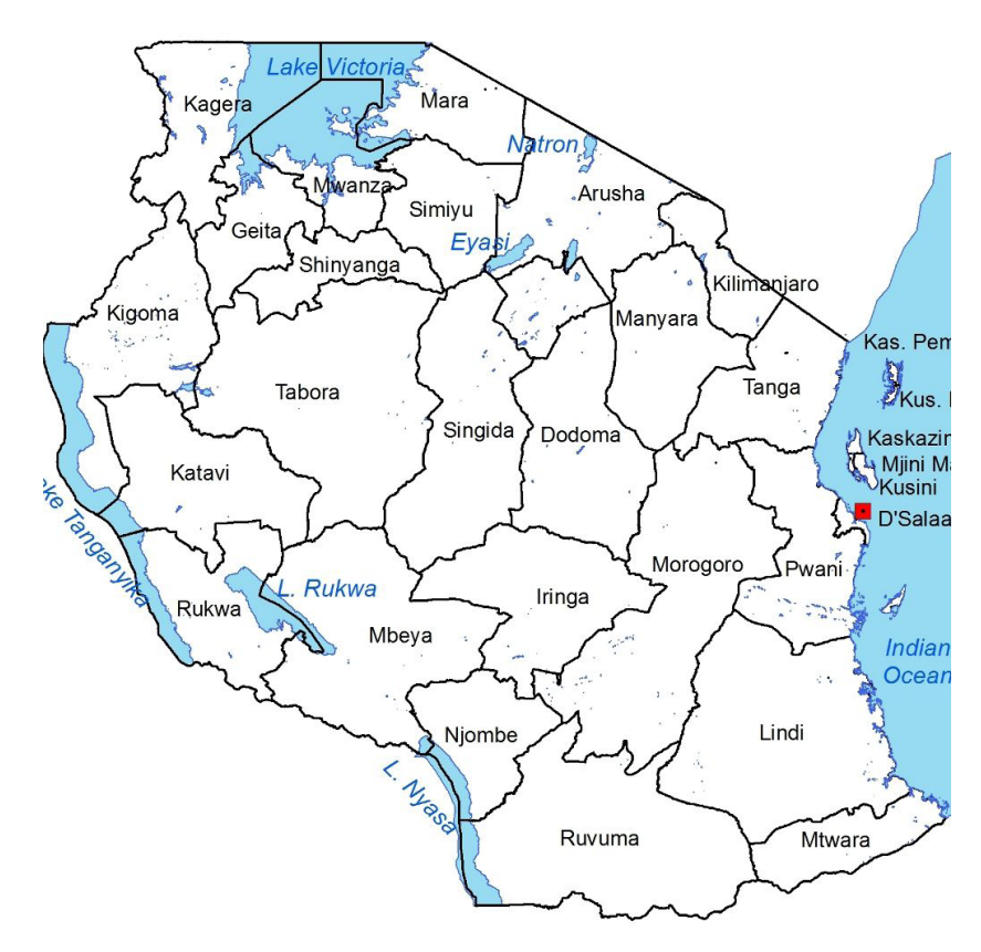
Figure 1 : The regions are Kilimanjaro (North), Mbeya (south) and Zanzibar (on the left of the map) both Unguja and Pemba

In the current trade regime, GIs are confronted in quality forums with new social concerns and values, from biodiversity to food security. As per the FAO (2009) it explains how GIs determine and influence food security by providing better income for producers and creating better economic access to food. Gls generate local economic benefits through greater market access and equity in international trade, thereby improving conditions for small and local farmers to sell their products and buy their necessities (Dagne, 2012). Gls "contribute to food security in rural areas, as far as they are considered and implemented as a rural development tool, and not only a commercial or legal one (Petrics and Eberlin, 2009). Gls have the potential as an economic policy instrument in helping to transform the Tanzania agriculture-dependent economy through exploiting the unique attributes of their quality products namely aroma, taste and colour. Tanzania has already demonstrated the capacity to tap into the organic world market. Therefore protecting Tanzania's unique agricultural products using GI could lead to higher value-added products through product differentiation based on quality, providing consumers with certified information regarding product