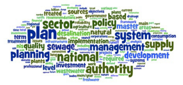
Word cloud ("water" removed) generated from the Israeli Long-Term Master Plan for the National Water Sector, 2011.

Current Egyptian policies are muddled by government instability; research reflecting on previous policies may thus be particularly relevant in informing possible future steps. This brief is based on the 2005 "Integrated