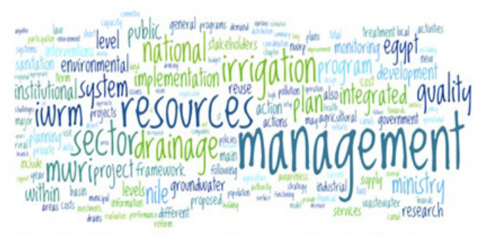
Word cloud ("water" removed )generated from the Egyptian Integrated Water Resources Management Plan, 2005.

Water Resources Management Plan" and "Water for the Future: National Water Resources Plan 2017", the latter of which was supported by the Dutch Government. Stated major concerns are water for people; water for food production; water for industry, services, and employment; develop-ping a strong institutional framework; quality, supply, and demand management; protection and restoration of vital ecosystems; and cooperation with Nile Basin countries.