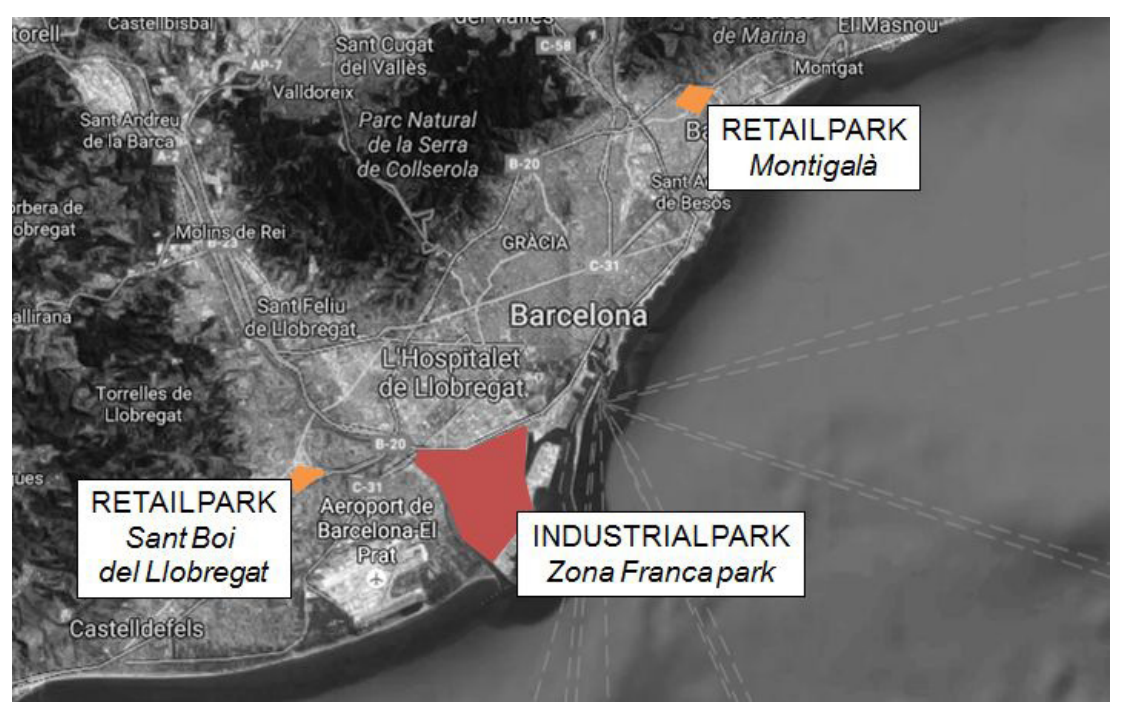
Figure 1 : Location of the case studies for the quantitative assessment of the potential implementation of RTGs in the metropolitan area of Barcelona: industrial park Zona Franca, retail park Montigalà and retail park Sant Boi del Llobregat (based on Google Maps image).

Table 3 : Short-term potential for implementation of RTGs in Barcelona: relative potential, absolute potential, tomato production, self-supply level and GHG emissions savings, by case study