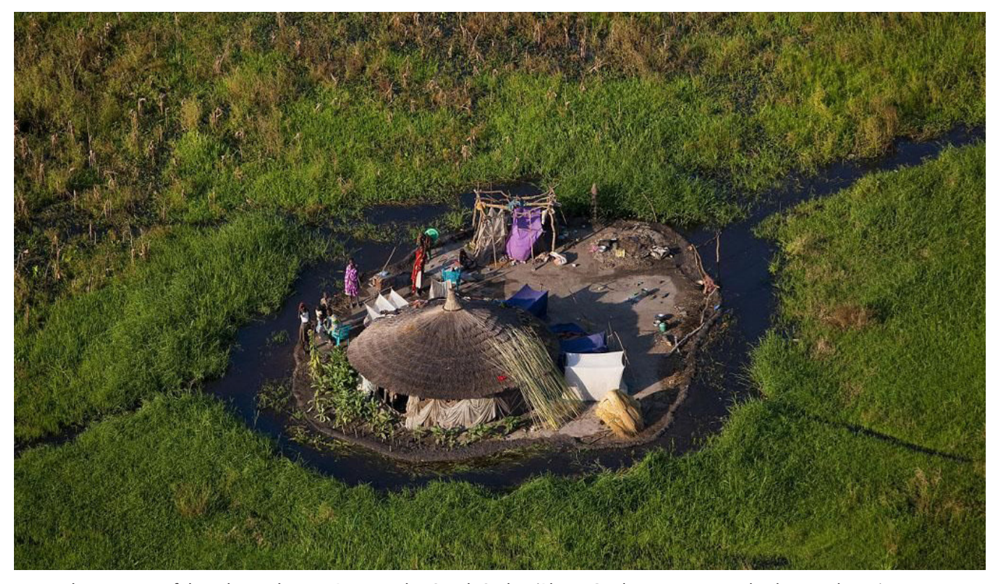
Hut in the swamps of the White Nile near Bor, Jonglei, South Sudan