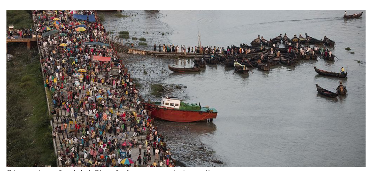
Chittagong's port, Bangladesh

The film takes a critical stance towards conventional methods of agriculture and husbandry and accurately shows these practices and industrial practices lead to world-wide natural damage. The film puts the blame on the development formation of megacities and their energy consumption pattern, the extra luxury cloned shapes of their suburbs, as well as their contamination impacts, providing the example of Los Angles in the United States of America and