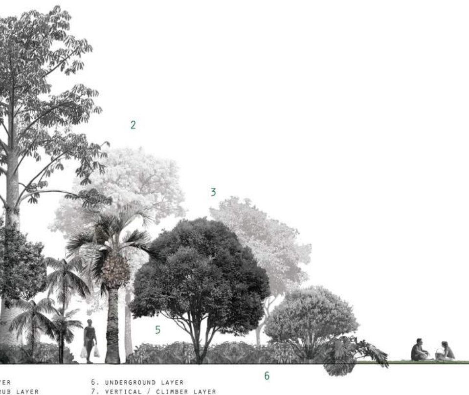
Layers of indigenous species