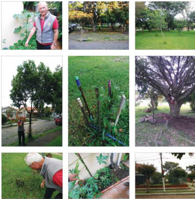
Figure 3: Site visit and interview reveal incipient urban agriculture practices at the Praça Bernardo Dreher, Porto Alegre

It is beyond the scope of the project to provide an accurate critique of Brazil's politics and socio-economic complexities in terms of urbanism. However, some landscape democratic practices can be traced in this context which lay the ground for further work. One key issue is how the economic disparity increasingly present in Brazilian society is creating more economically stratified spaces in the city.