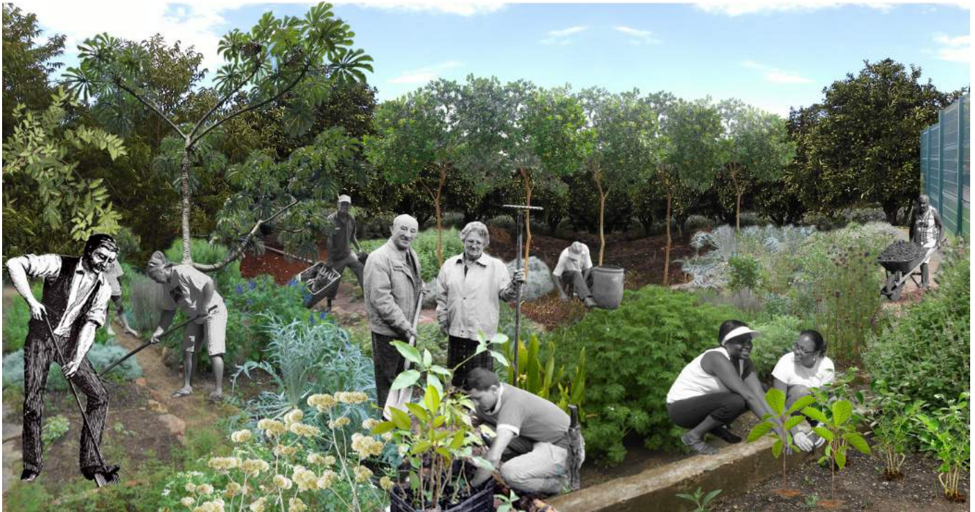
Figure 5: Imagining a bottom-up initiative creating a community garden and tree nursery in the Vila São José (Illustration credit: Jacques Abelman)

sure value of areas that were previously lawn or concrete, creating a new form of urban park. Because the maintenance of the trees and the harvesting of the fruit is labour intensive, many new jobs could be created not requiring intensive training or education but instead relying on basic agricultural skills.