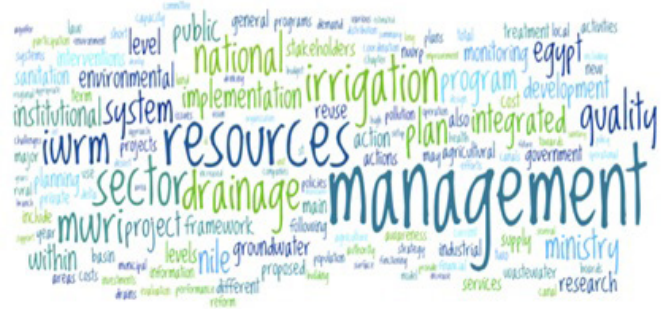
Word cloud ("water" removed) generated from the Egyptian Integrated Water Resources Management Plan, 2005.

Water Resources Management Plan" and "Water for the Future: National Water Resources Plan 2017", the latter of which was supported by the Dutch Government. Stated major concerns are water for people; water for food production; water for industry, services, and employment; developing a strong institutional framework; quality, supply, and demand management; protection and restoration of vital ecosystems; and cooperation with Nile Basin countries.