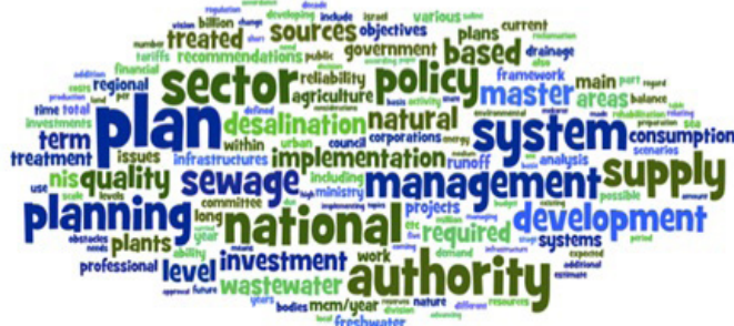
Word cloud ("water" removed) generated from the Israeli Long-Term Master Plan for the National Water Sector, 2011.

Current Egyptian policies are muddled by government instability; research reflecting on previous policies may thus be particularly relevant in informing possible future steps. This brief is based on the 2005 "Integrated