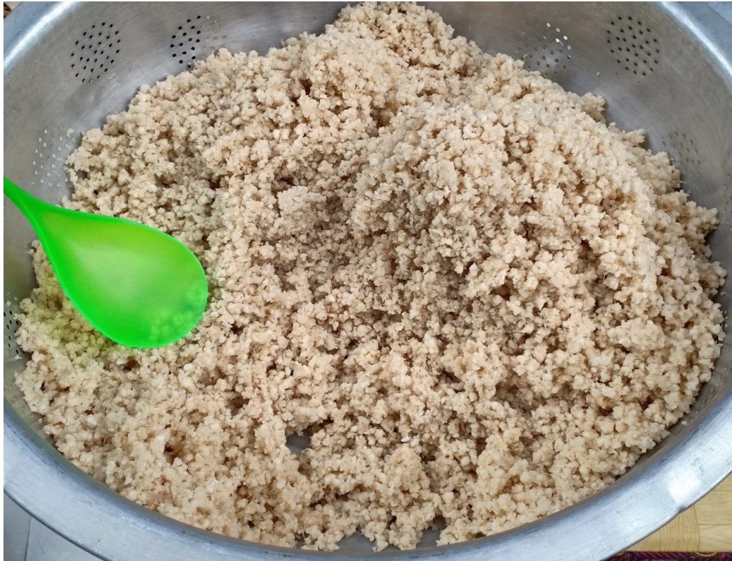
Figure 3. Rasi , the cassava ( Manihot esculenta ) processed products from Cireundeu Village, Cimahi City, West Java Province, Indonesia. The processing process is done through nyampeu ( rasi processing method which Omoh Asnamah spearheaded since 1924).

During this time, Asnamah introduced nyampeu , the rasi processing method. Nyampeu consists of eleven stages. The stages starting from ngerik (scraping), ngupas (peeling), ngabilas (washing), marud (grating), meres (wetting, stirring, swinging, pressing and sedimentation), moé (sun drying), nutu (pounding), ngayak (sieving), nyaian (moistening), nyeupankeun (steaming) and ngakeul (cooling and stirring).