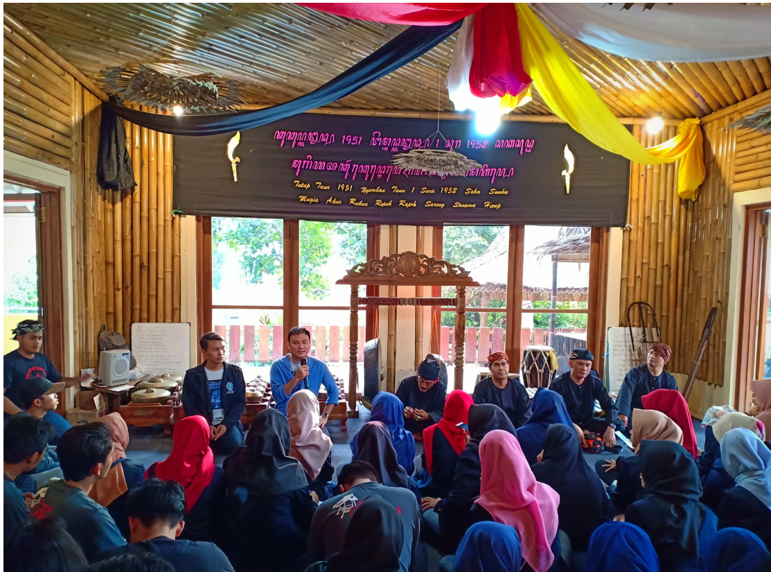
Figure 6. Food security education to tourists in the Cireundeu Village environment.

opment of culinary tourism potential, food security, values and socio-cultural life for the society and intercultural relations in a sustainable. The government can develop a national food security education curriculum based on local knowledge.