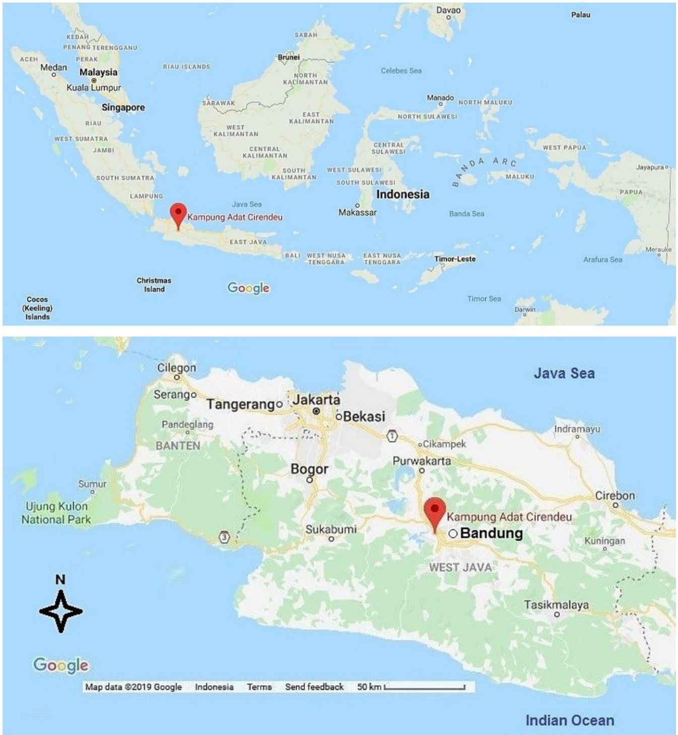
Figure 2. Cirendeude indigenous people live in Java Island, Cirendeude Village, Cimahi City, West Java Province. Cirendeude Village is southeast of Jakarta, the Capital City of Indonesia and west of Bandung City, the Capital City of West Java Province (Google, 2019).