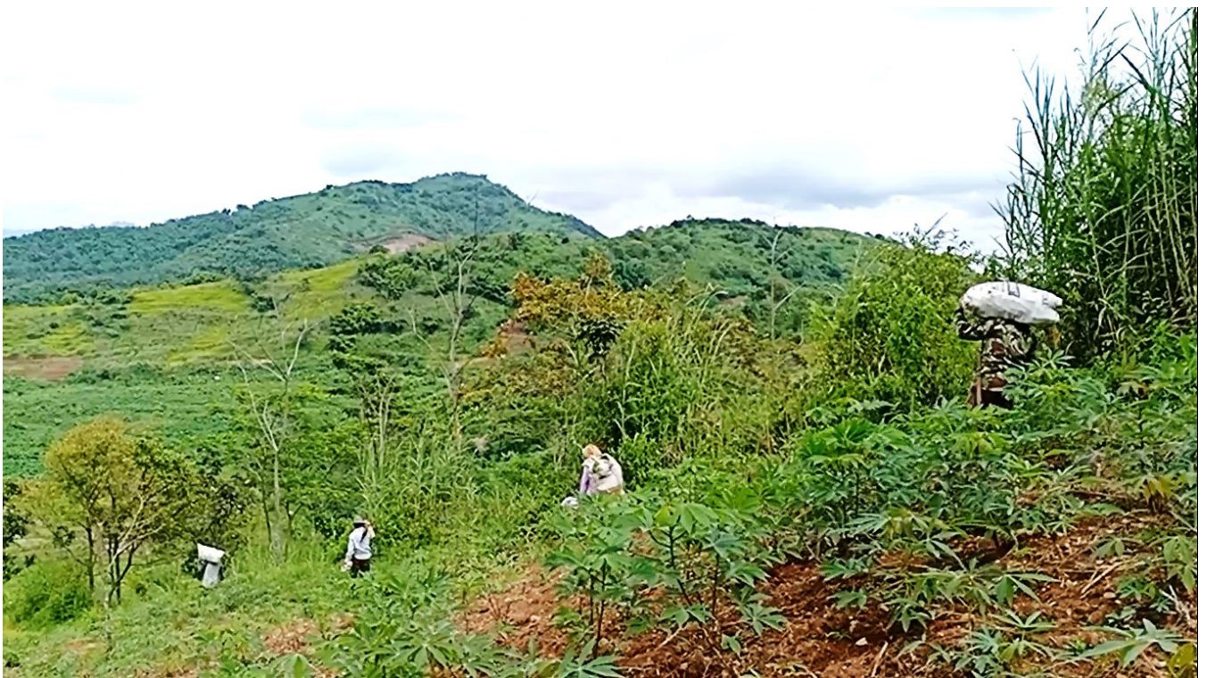
Figure 5. Cassava farming activities carried out by Cireundeu indigenous people in leuweung baladahan , Cireundeu Village, Cimahi City, West Java Province, Indonesia. Leuweung baladahan is land used for cassava agricultural activities (primary) and various other consumption crops.

The reason for consuming rasi as staple food comes from within the Cireundeu indigenous people itself. Rasi is consumed for six reasons: efforts to respect ancestral struggle, undergo ancestral revelation, physical and psychological independence, as a source of strength, carbohydrate, and energy, energy-saving, and preserve tradition. The effort to preserve traditions is considered the most common reason to consume rasi as a staple food. All of that is supported by cassava production activities in the Cireundeu Village environment ( leuweung baladahan ), Cireundeu Village, Cimahi City, West Java Province, Indonesia. Besides that, this food culture can be used to reference the importance of the uniqueness of agricultural activities, food culture, and ethnic food in the devel-