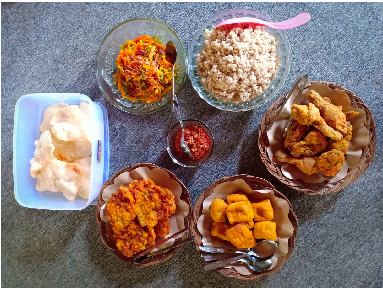
Figure 4. Examples of various sources of nutrition consumed by the Cireundeu indigenous people.

Based on Table 2, if rasi is consumed as much as 1 kg/person/day, the recommended dietary allowances of carbohydrates, sodium, and magnesium are fulfilled. At the same time, however, the recommended dietary allowances of protein, fat, fibre, water, phosphorus, potassium, calcium, manganese, iron, and zinc is not met. To mitigate this problem, the Cireundeu indigenous people consume carrot, chicken, chilli