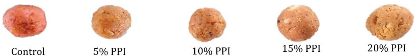
Figure 2. Color of the commercially available plant-based minced meatball (control) and plant-based minced meatball with different pea protein isolate levels (5%, 10%, 15%, and 20%, w/w).

Mean ± SD with different lowercase superscripts in each column are significantly ( p < 0.05 ) different