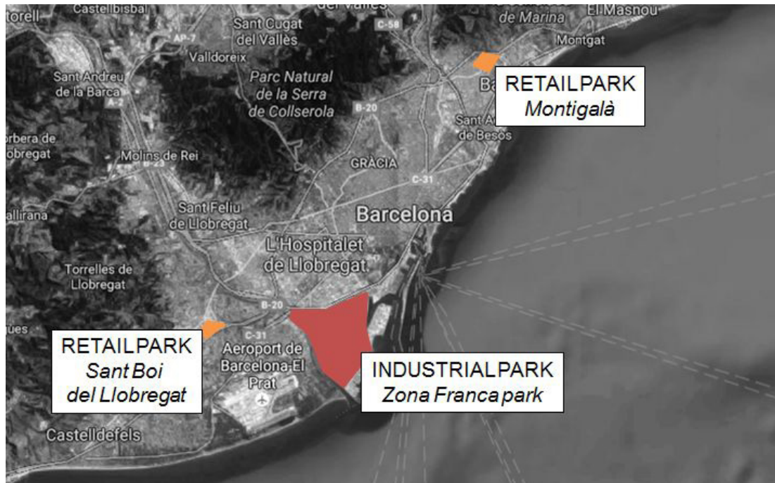
Figure 1: Location of the case studies for the quantitative assessment of the potential implementation of RTGs in the metropolitan area of Barcelona: industrial park Zona Franca, retail park Montigalà and retail park Sant Boi del Llobregat (based on Google Maps image).