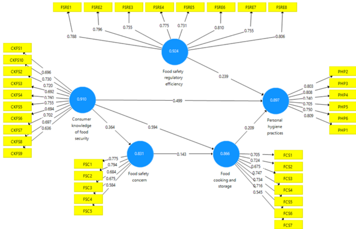
Figure 2: Estimated Model.

indicators, from 0.705 to 0.809, suggesting well-defined and reliable item-construct relationships. Overall, these statistics demonstrate high measurement adequacy and reinforce the robustness of the indicators used for analysis.