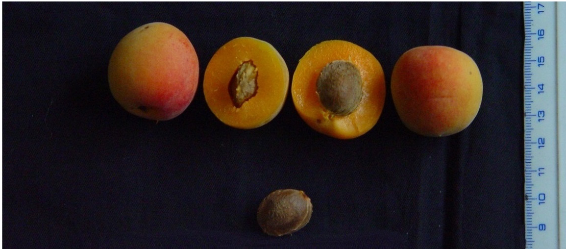
Figure 1 a: Antonio Errani - Pit, flesh and mature fruits of apricot cultivars