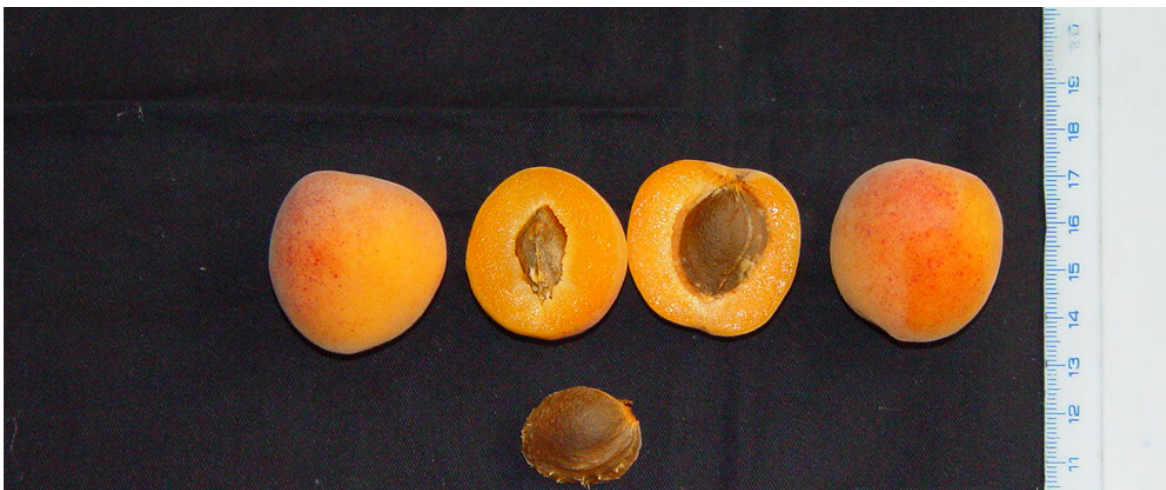
Figure 1 b: Tirynthos - Pit, flesh and mature fruits of apricot cultivars