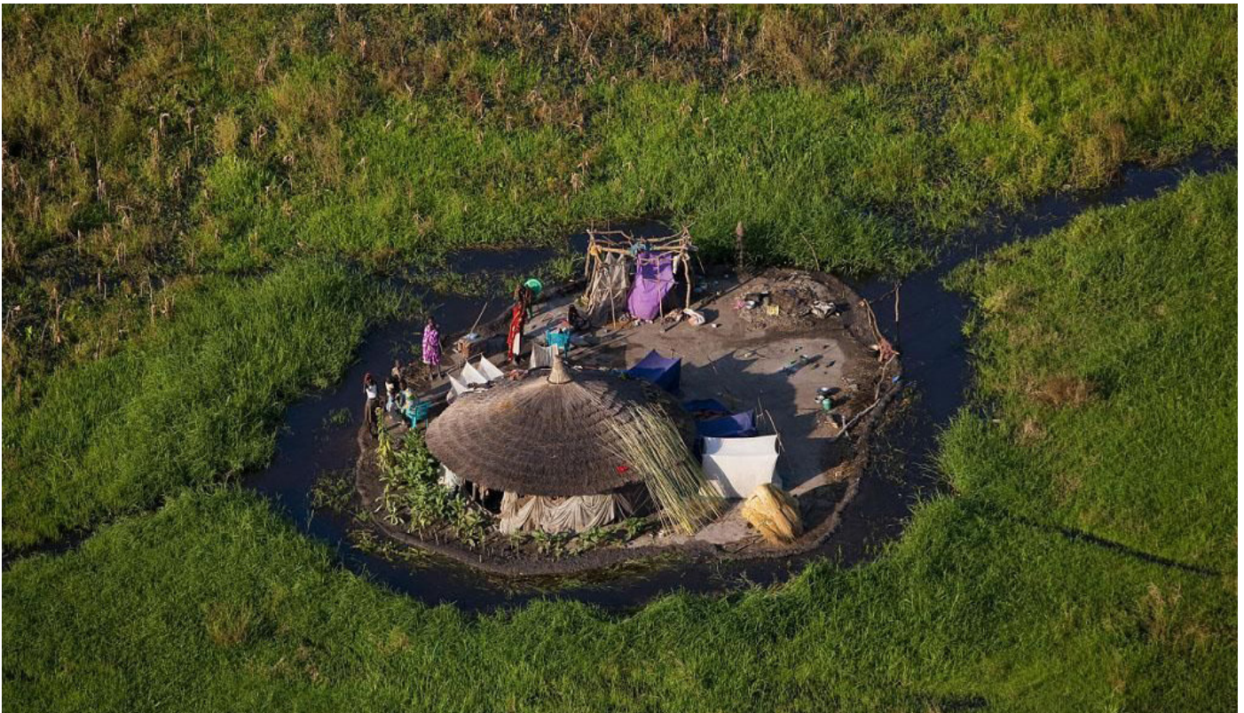
Hut in the swamps of the White Nile near Bor, Jonglei, South Sudan