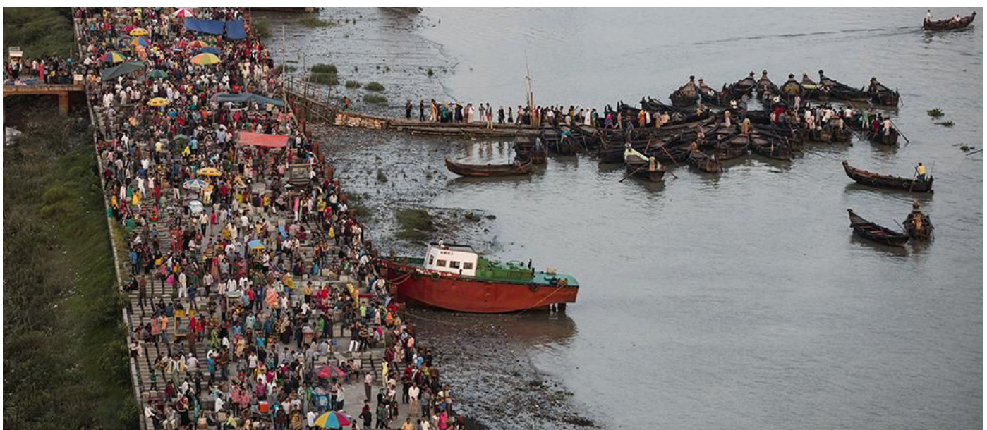
Chittagong's port, Bangladesh

The film takes a critical stance towards conventional methods of agriculture and husbandry and accurately shows these practices and industrial practices lead to world-wide natural damage. The film puts the blame on the development formation of megacities and their energy consumption pattern, the extra luxury cloned shapes of their suburbs, as well as their contamination impacts, providing the example of Los Angeles in the United States of America and